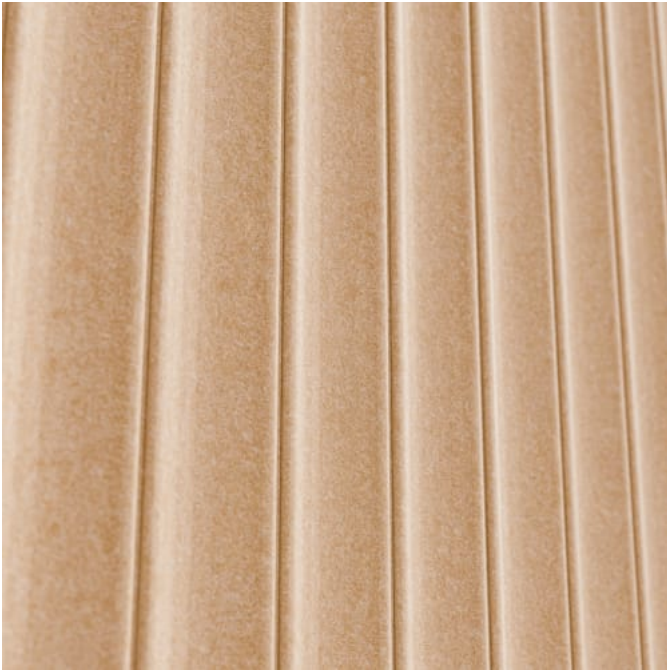
Emboss Panel Scallop Detail Ecru