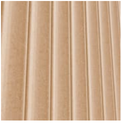
Emboss Panel Scallop Detail Ecrú