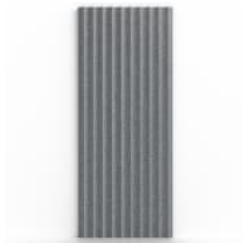
Emboss Panel Scallop Detail