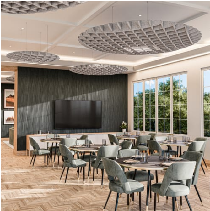
Emboss Panel Rivulet - Twilight & Smoke