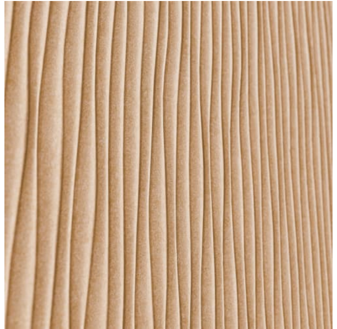
Emboss Panel Rivulet Detail Ecrú