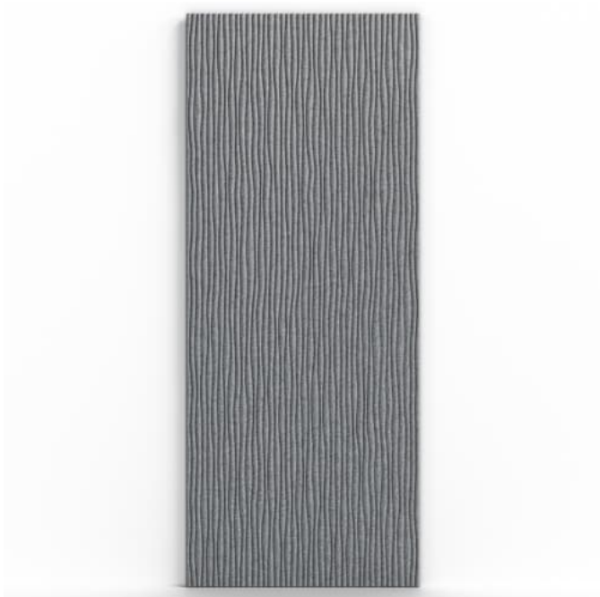
Emboss Panel Rivulet Detail Ecrú