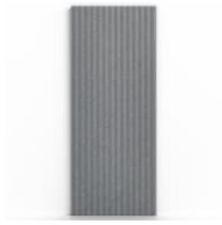
Emboss Panel Corduroy Fine Detail