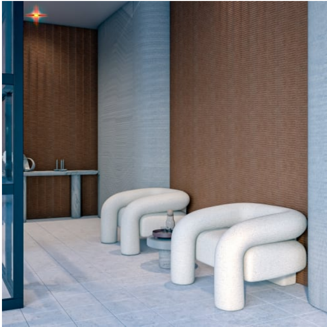
Emboss Panel Ascend Saffron