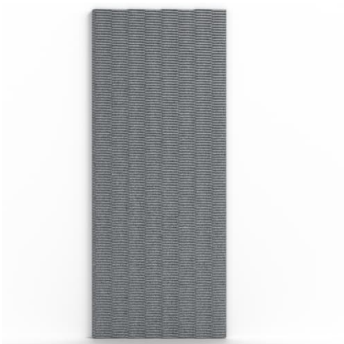
Emboss Panel Ascend Detail