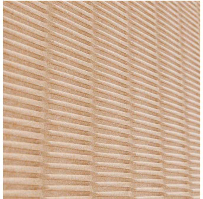
Emboss Panel Ascend Detail Ecru