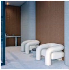
Emboss Panel Ascend Saffron