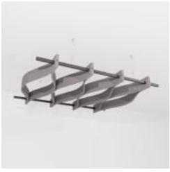
Baffle System Wave Detail