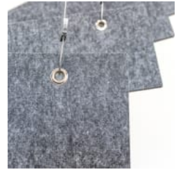
Baffle Systems Grommet Detail