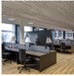
Baffle Systems Individual Linen