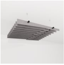
Baffle Systems Bolt Detail