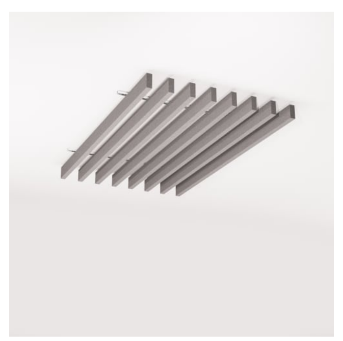
Beams Parallel Rafter Detail