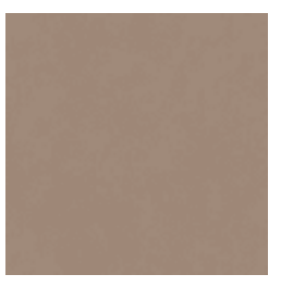
Terracotta Sun Bleached