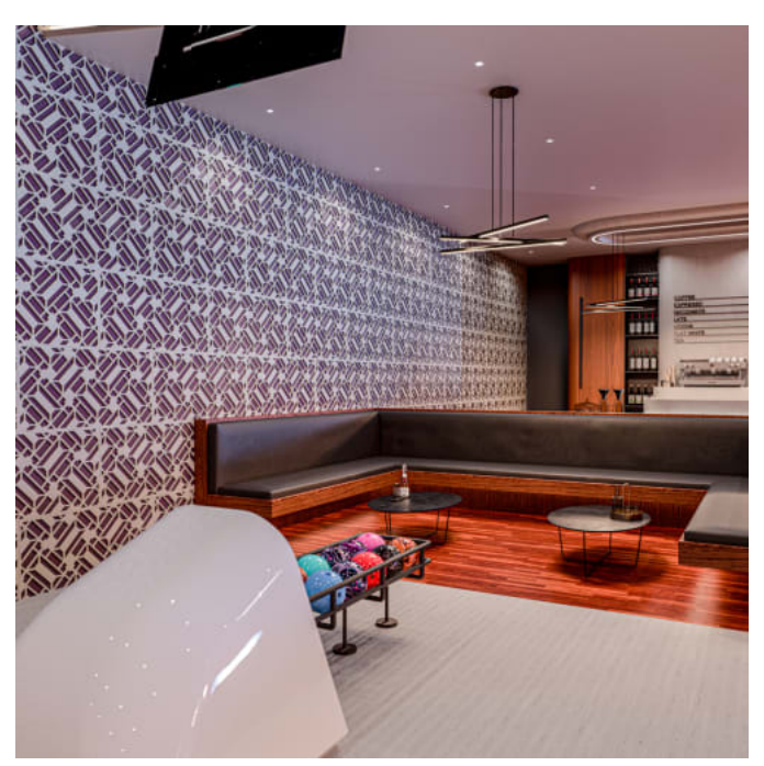
Pattern Panel Circuit - Chambray