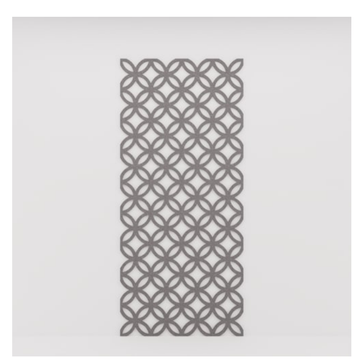
Pattern Panel Vedic Detail