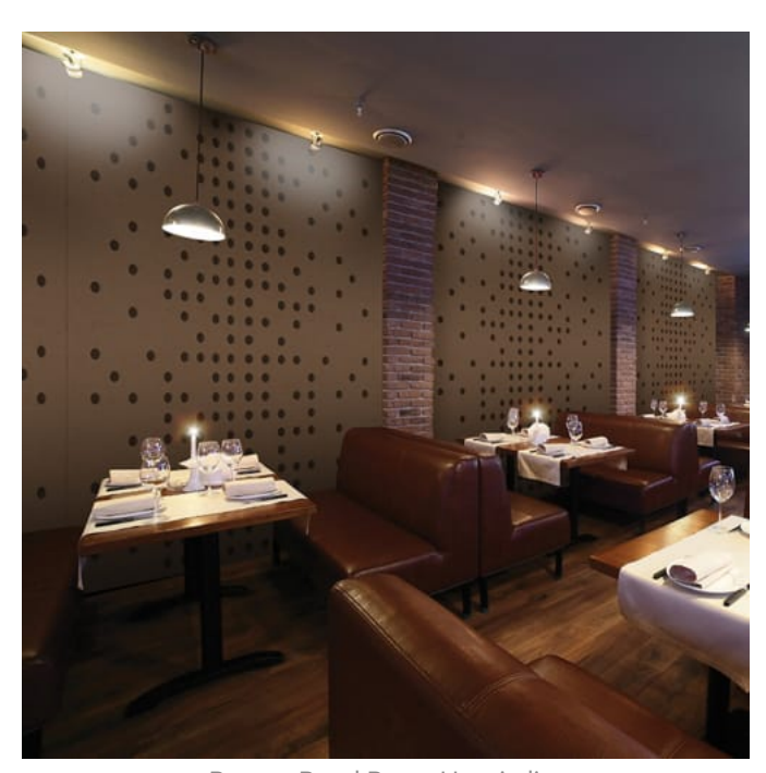
Pattern Panel Punto Hospitality