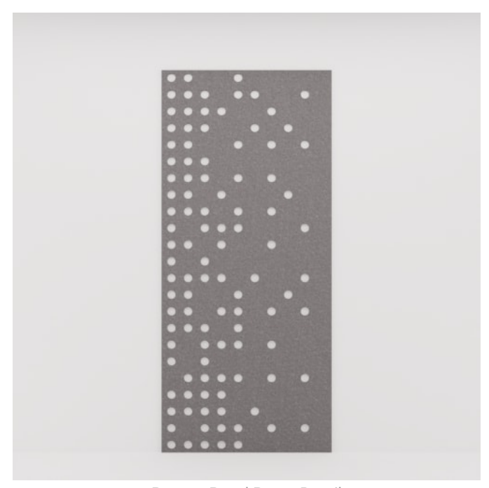
Pattern Panel Punto Detail