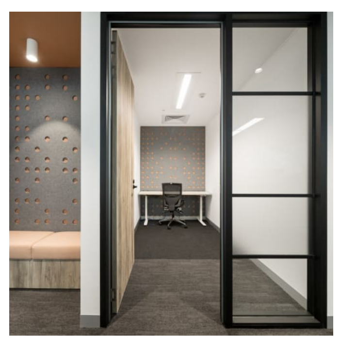
Pattern Panel Punto