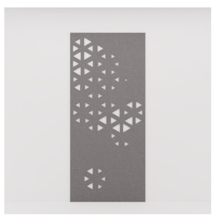
Pattern Panel Prose Detail