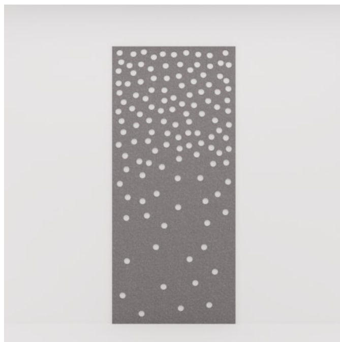
Pattern Panel Perdita Detail