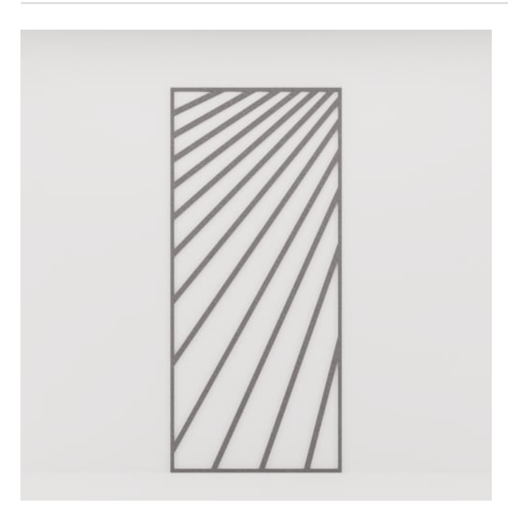
Pattern Panel Nadu Detail