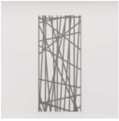
Pattern Panel Monsoon Detail