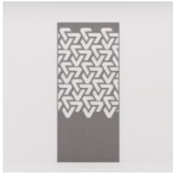
Pattern Panel Lost Detail