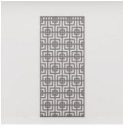
Pattern Panel Indus Detail