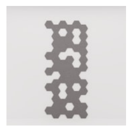
Pattern Panel Hex Detail