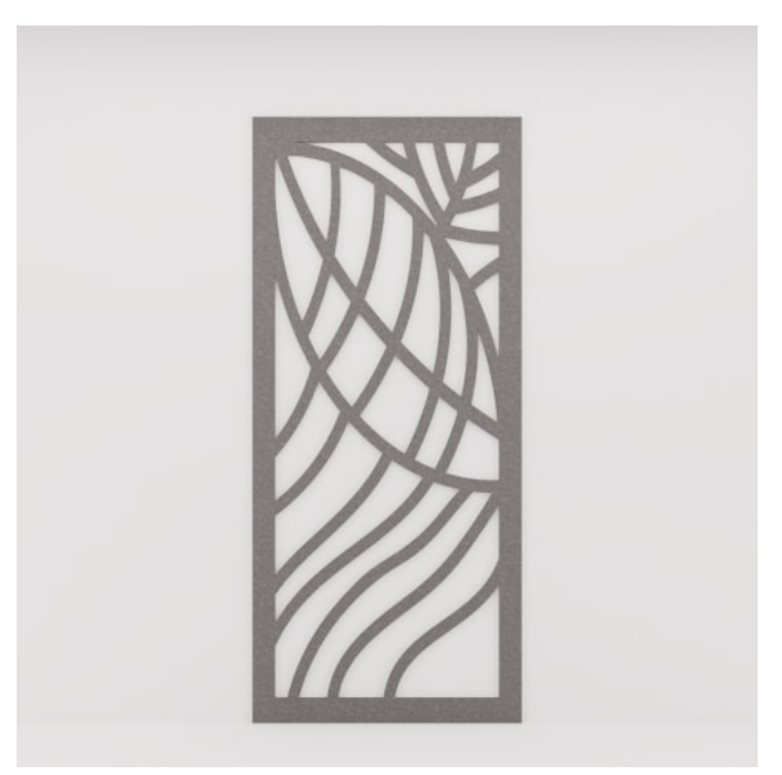
Pattern Panel Foliage A Detail