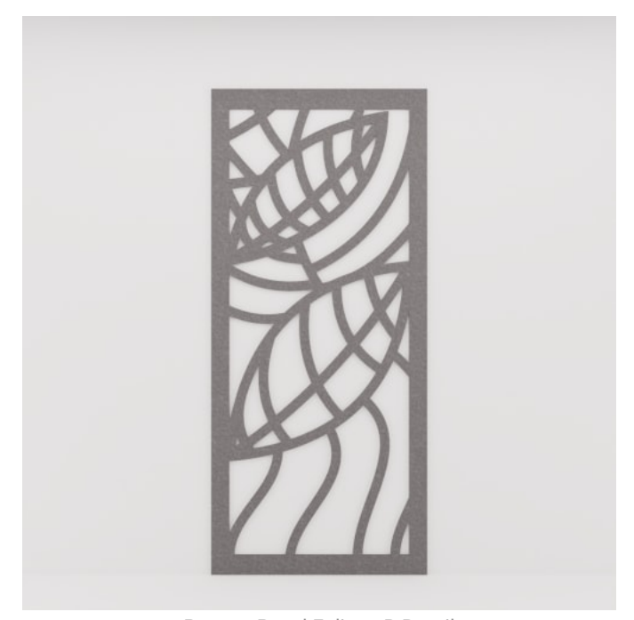
Pattern Panel Foliage B Detail