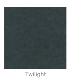
Zintra Timber Print