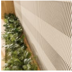
Etch Tiles Louver Detail