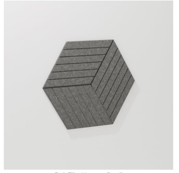
Etch Tiles Hexagon Detail