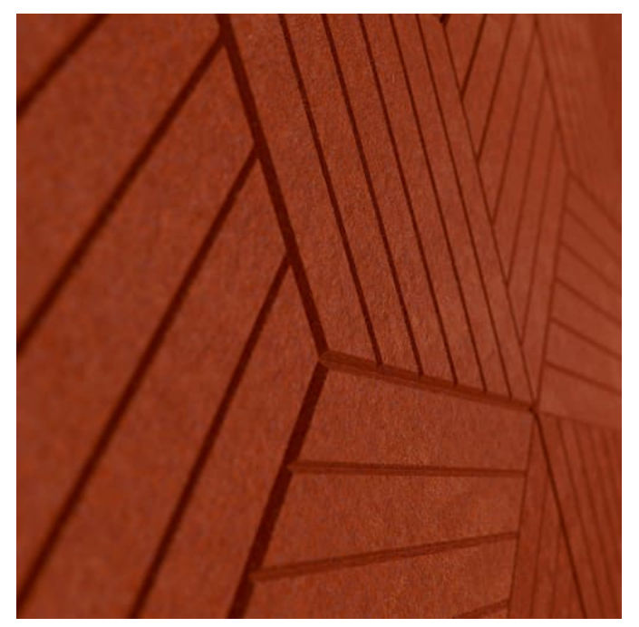
Etch Tiles Hex Detail