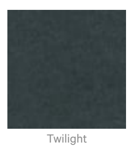
Zintra Timber Print