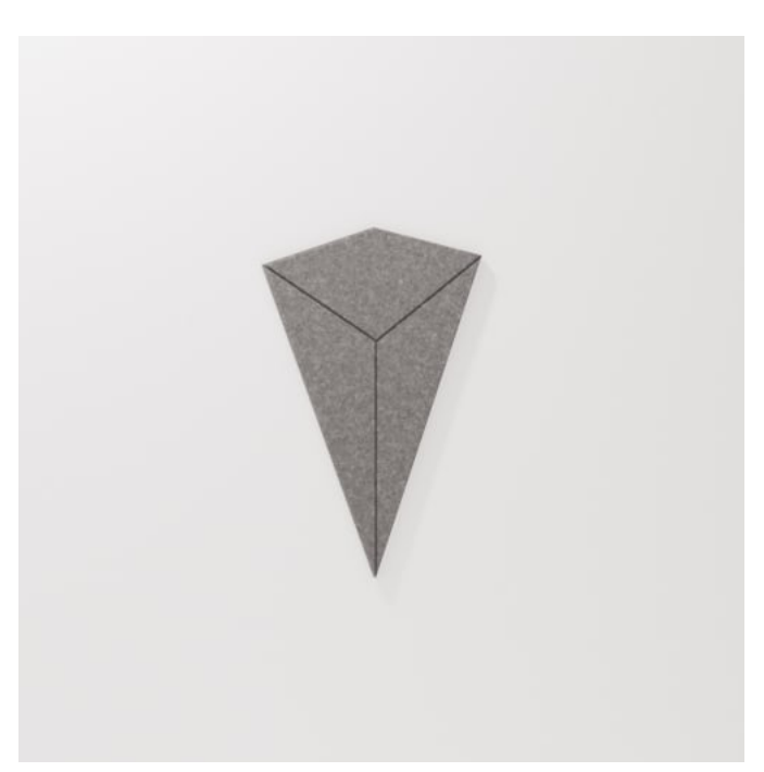
Etch Tiles Diamond Detail