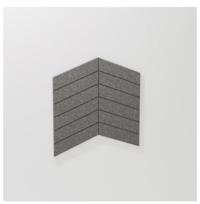
Etch Tiles Chevron Detail