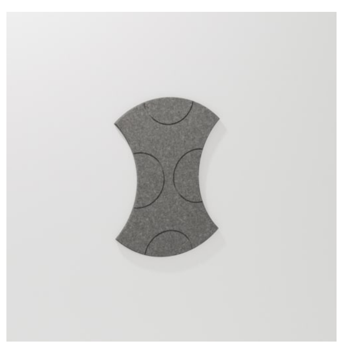
Etch Tiles Battleaxe Detail