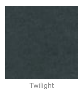
Zintra Timber Print