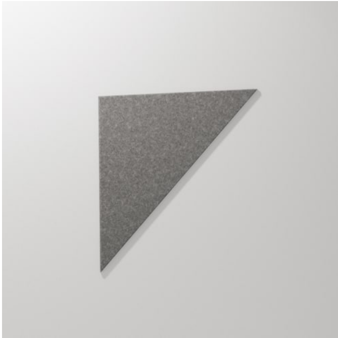
Plain Tile Triangle Detail