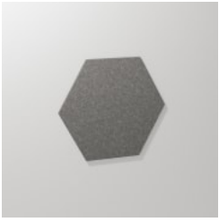
Plain Tile Hexagon Detail