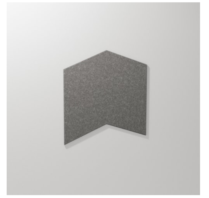
Plain Tile Chevron Detail