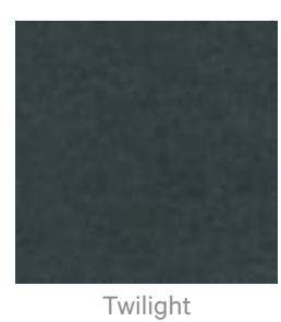
Zintra Timber Print