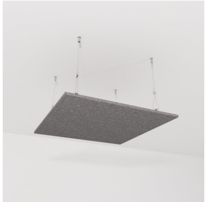
Shapes Square Detail