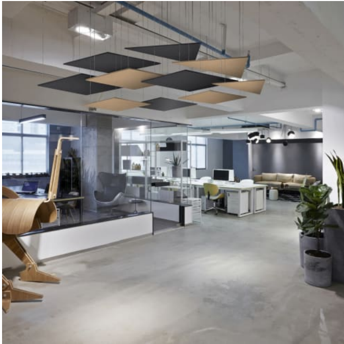
Shapes Square and Triangle