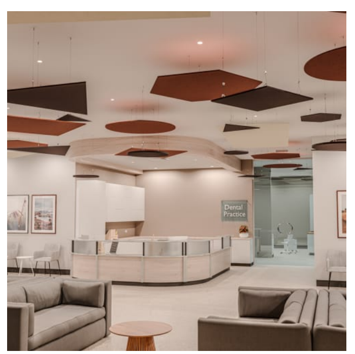
Shapes Circle Detail