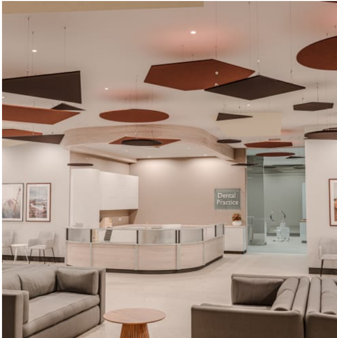
Shapes Square, Hexagon & Circle