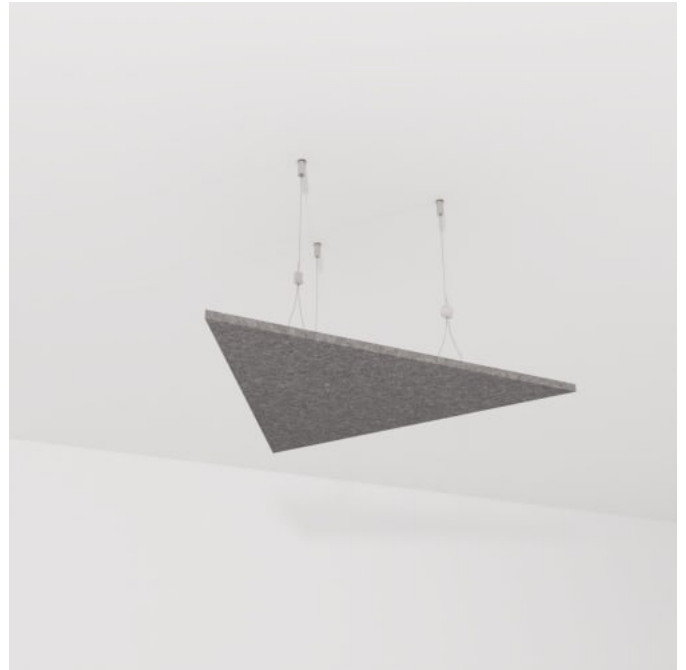
Shapes Triangle Detail