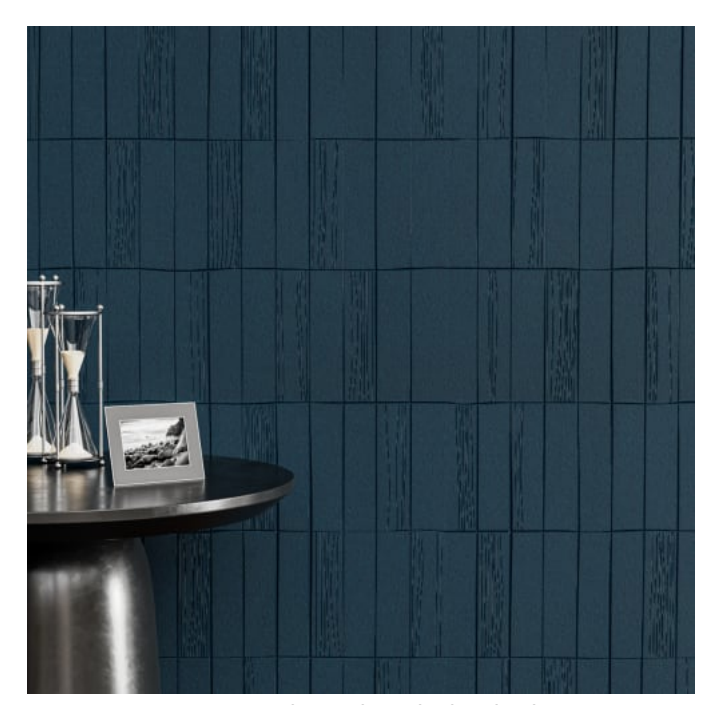
Organic Etch Panel Stacked Midnight