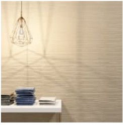
Organic Etch Panel Rivers Horizontal Linen