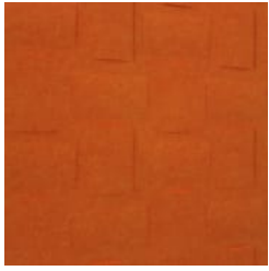
Texture Tissage Detail