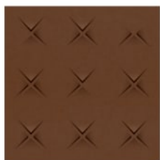
Texture Signe Detail