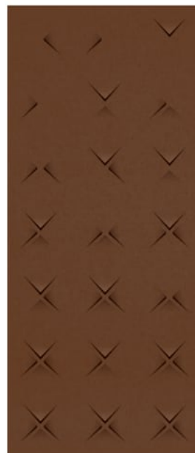
Texture Signe Panel