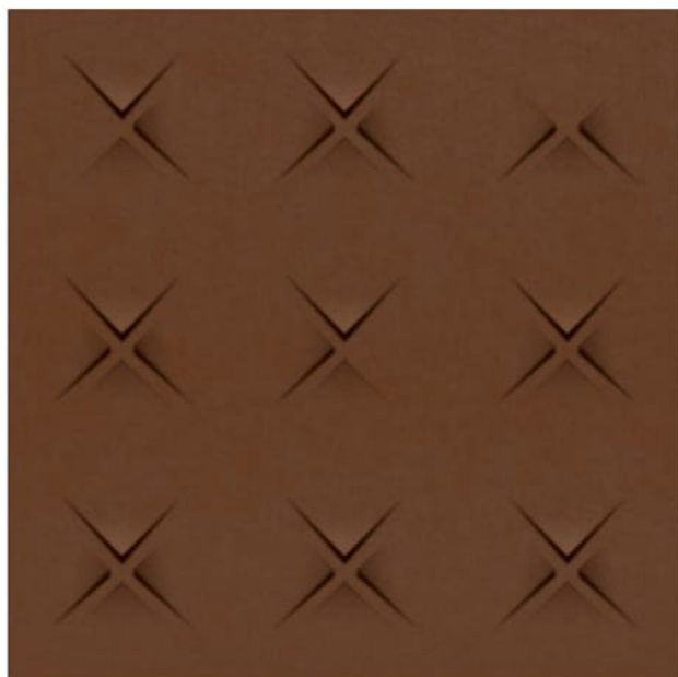
Texture Signe Detail