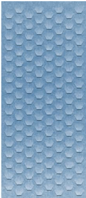
Texture Hexagone Panel