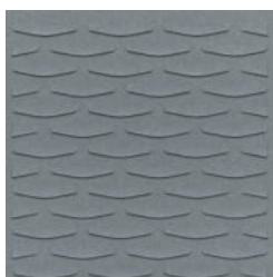
Texture Echelle Detail