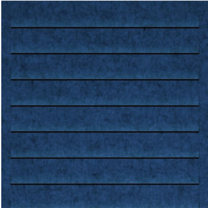
Texture Droit Detail