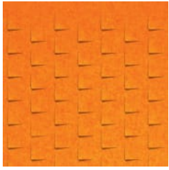
Texture Diamont Detail