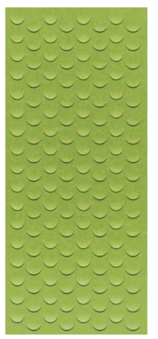
Texture Cercle Panel