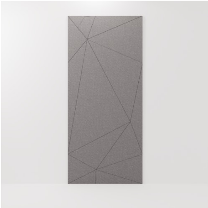
Etch Panel Craze Detail