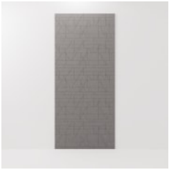
Etch Panel Volta Detail