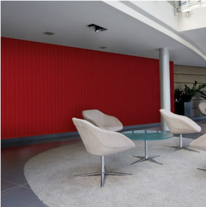
Etch Panel VJ Board Wide Ochre 2