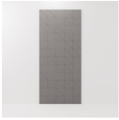
Etch Panel Tetris Detail