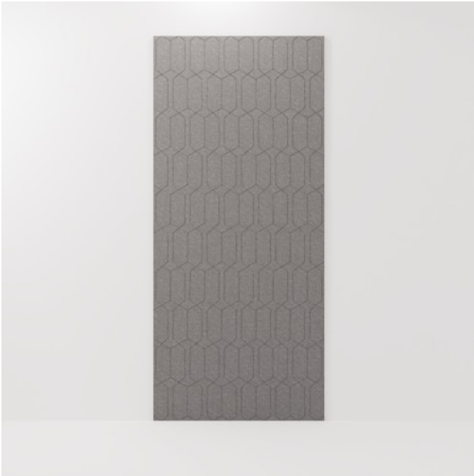
Etch Panel Spectrum Detail