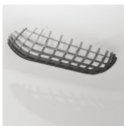
Clouds Long Dome Convex Detail