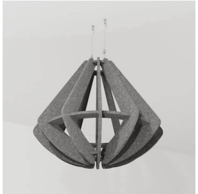
Clouds Blanchard Detail