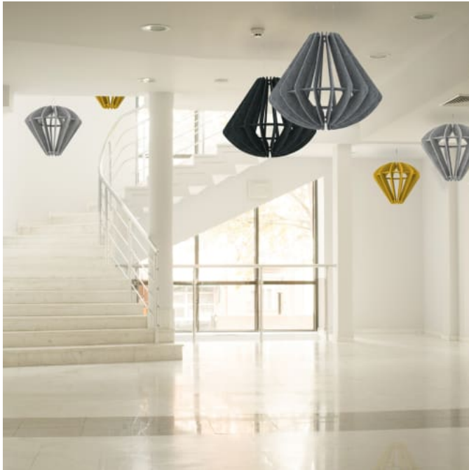
Clouds Blanchard Pewter Tar Sunshine