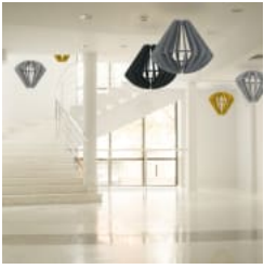
Clouds Blanchard Pewter Tar Sunshine