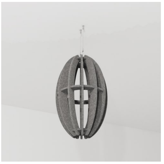
Clouds Giffard Detail