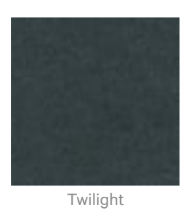
Zintra Timber Print