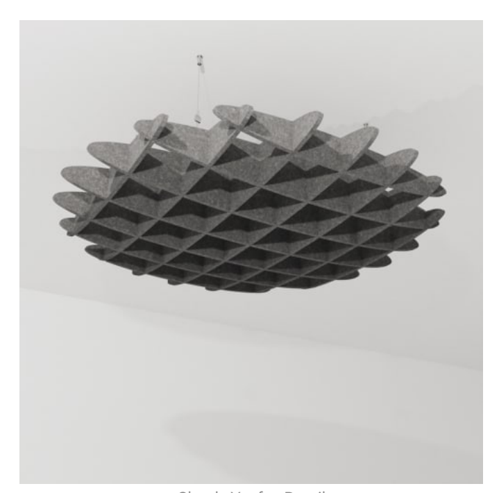
Clouds Yoofoe Detail